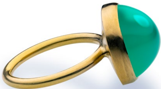
Opal Berry ring £6250