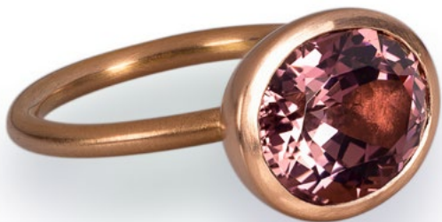
Rose Statement ring £4500