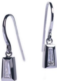
Tapered diamond earrings £3250