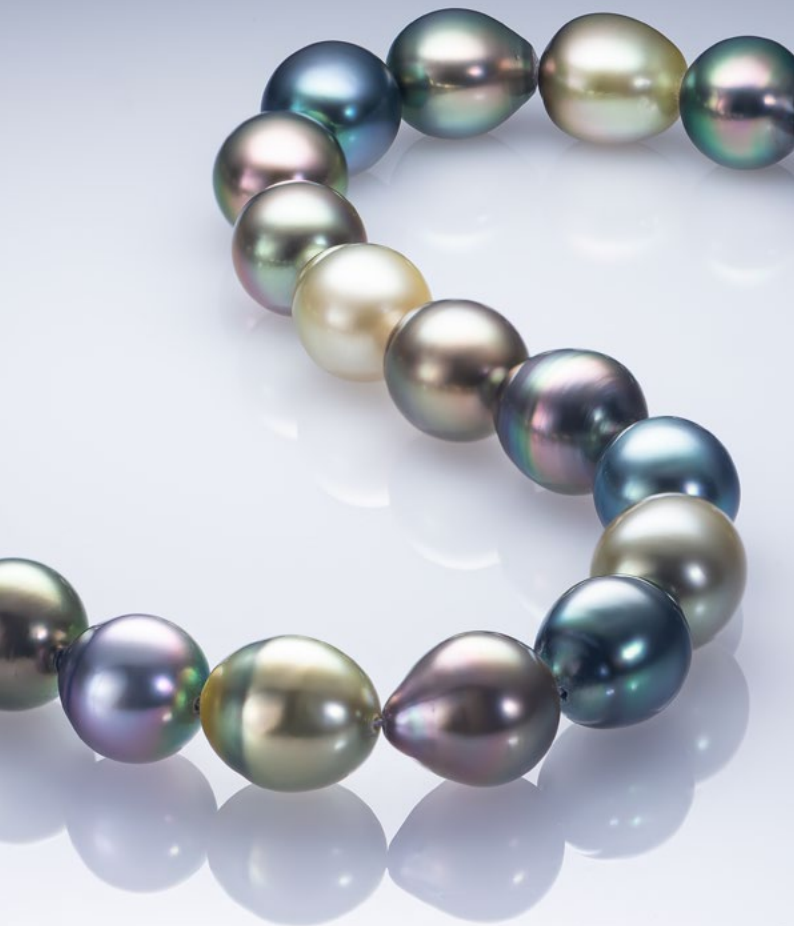
Peacock Pearl necklace £8250