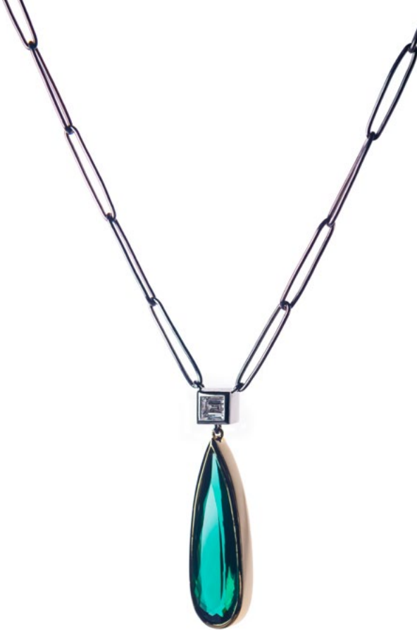
Marina necklace £11800