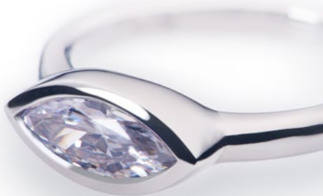
Marquise ring £11500