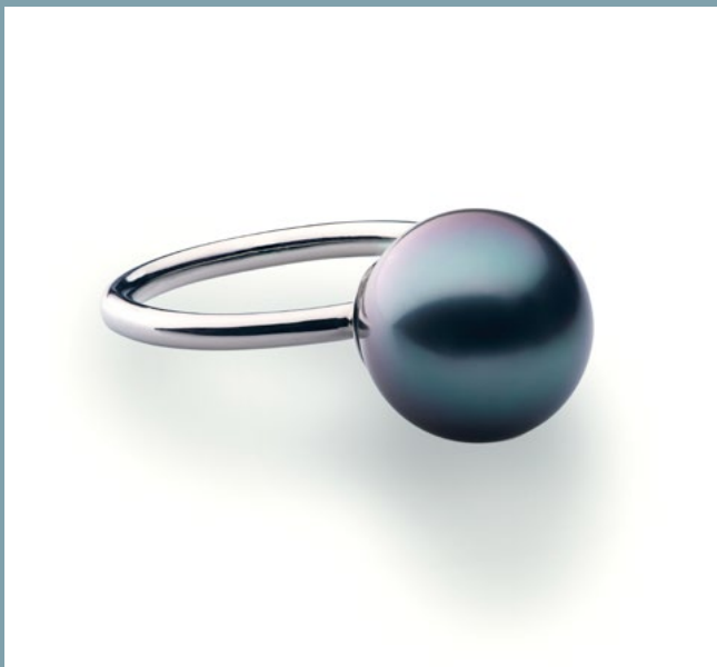
Tahiti Pearl ring £3500