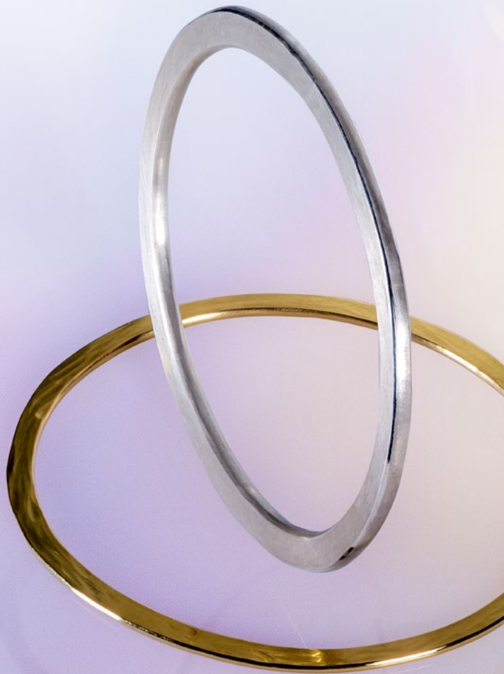
Oval Forged bangles from £550