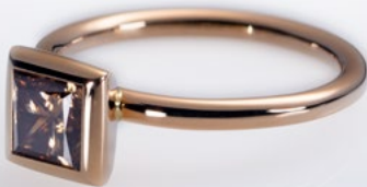
Cognac Square ring £8950