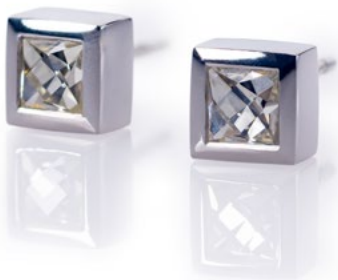
Gustavo studs £4450

To visit a showcase of the jewellery featured, click here to find out more about each piece just click on the caption or image.