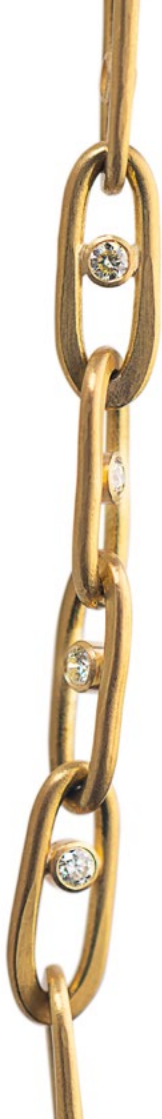
Stardust bracelet £8250