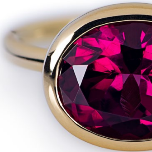
Moyo Statement ring £4950

These beautiful gemstones include ruby, tourmaline, amethyst and more, all traceable from mine to market. If you would like to commission us to make a piece of jewellery with a Moyo Gem, contact us and share your ideas.