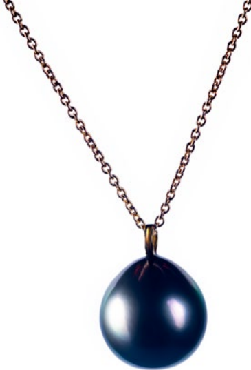
Tahiti Pearl pendant £2800